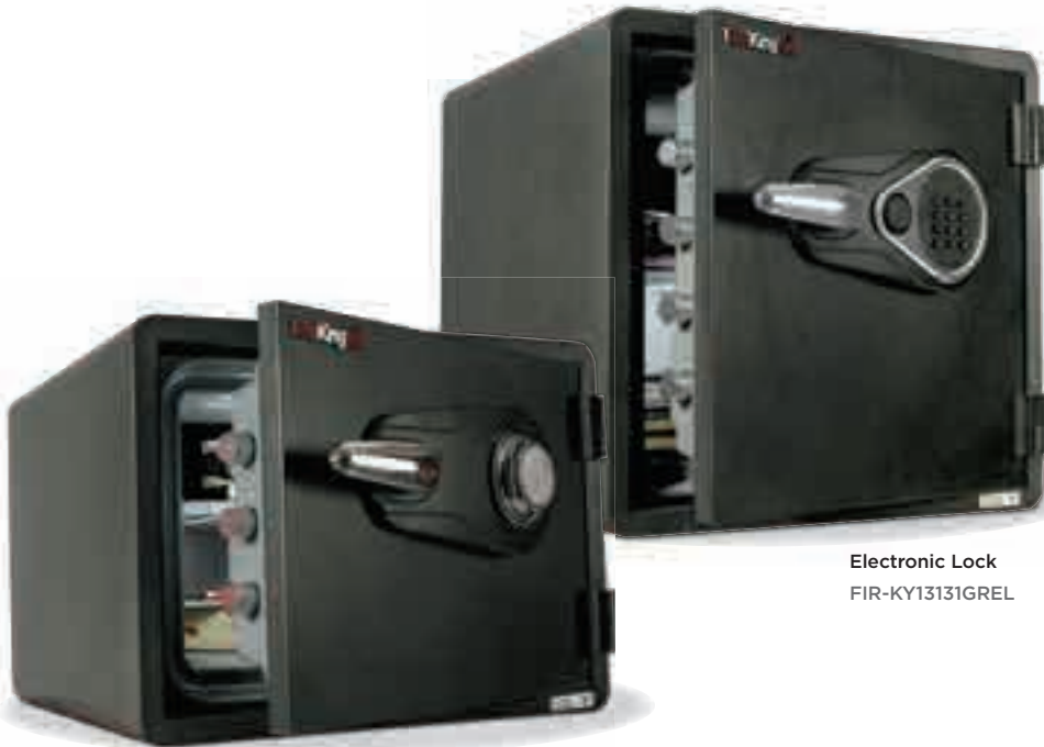
Electronic Lock FIR-KY13131GREL

★ FIR-KY19151GRCL—Interior: 15 1 / 2 " × 13" × 18 1 / 4 " FIR-KY13131GRCL—Interior: 13" × 13" × 12 5 / 8 " FIR-KY09131GRCL—Interior: 13" × 13" × 8 3 / 4 "