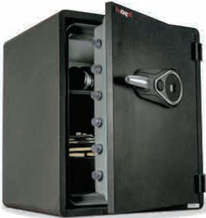
Biometric Fingerprint Lock FIR-KY19151GRFL