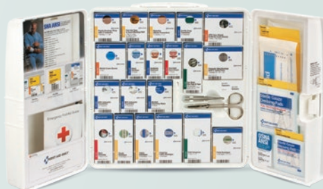
ANSI 2015 SmartCompliance First Aid Station for 50 People, 202 Pieces