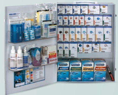
ANSI 2015 Compliant Industrial First Aid Kit for 200 People, 1659 Pieces

Don't forget - regularly assess your first aid kits to check expiration dates and refill and replenish supplies.