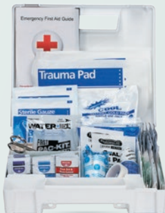
ANSI 2015 Compliant Class A Type I & II First Aid Kit for 25 People, 89 Pieces

Meet ANSI standards and OSHA requirements with first aid kits that keep supplies accessible and in place. We offer a broad selection for every size business plus refill items.